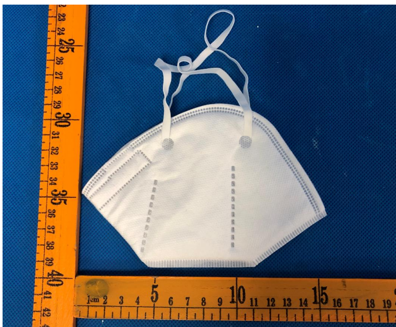
General view for KN95-PTMYKZ-01