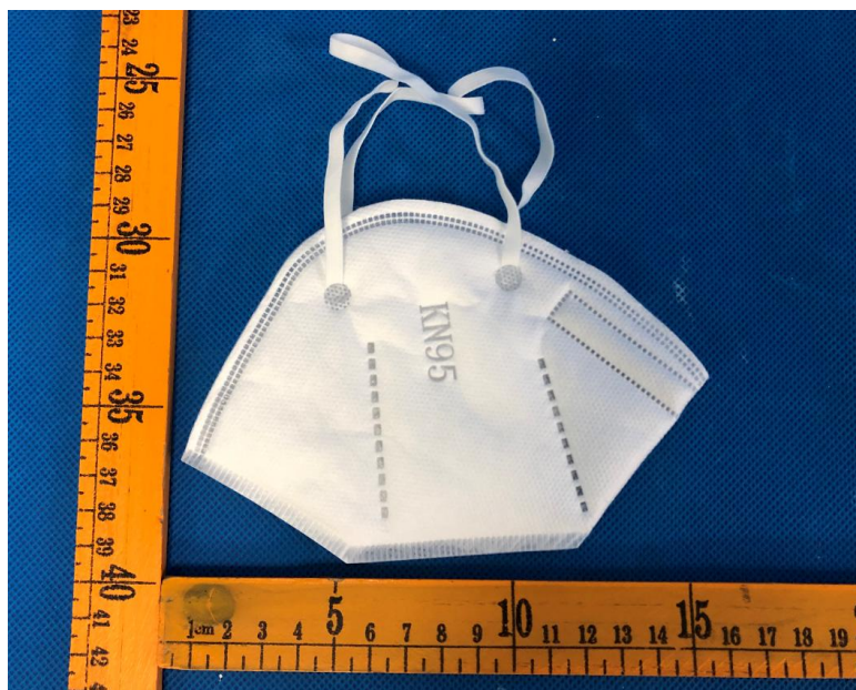
General view for KN95-PTMYKZ-01

This report shall not be altered, increased or deleted. The results shown in this test report refer only to the sample(s) tested. Without written approval of BTK, this test report shall not be copied except in full and published as advertisement. BTK Physical & Chemical Lab.