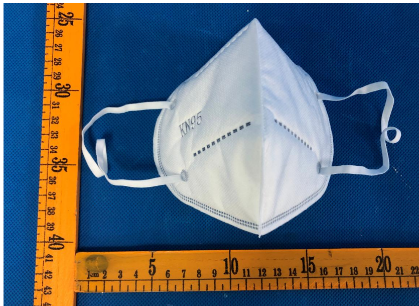
General view for KN95-PTMYKZ-01